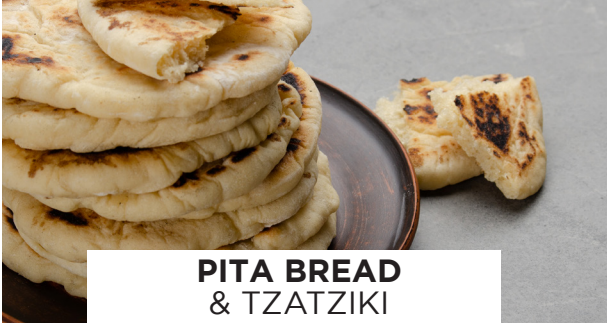
PITA BREAD & TZATZIKI